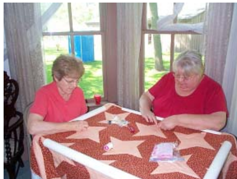
Quilters in the Ness House