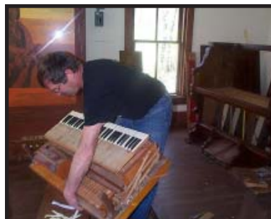
Taking the pump organ apart