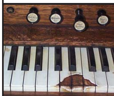
↑ Before and After ↓